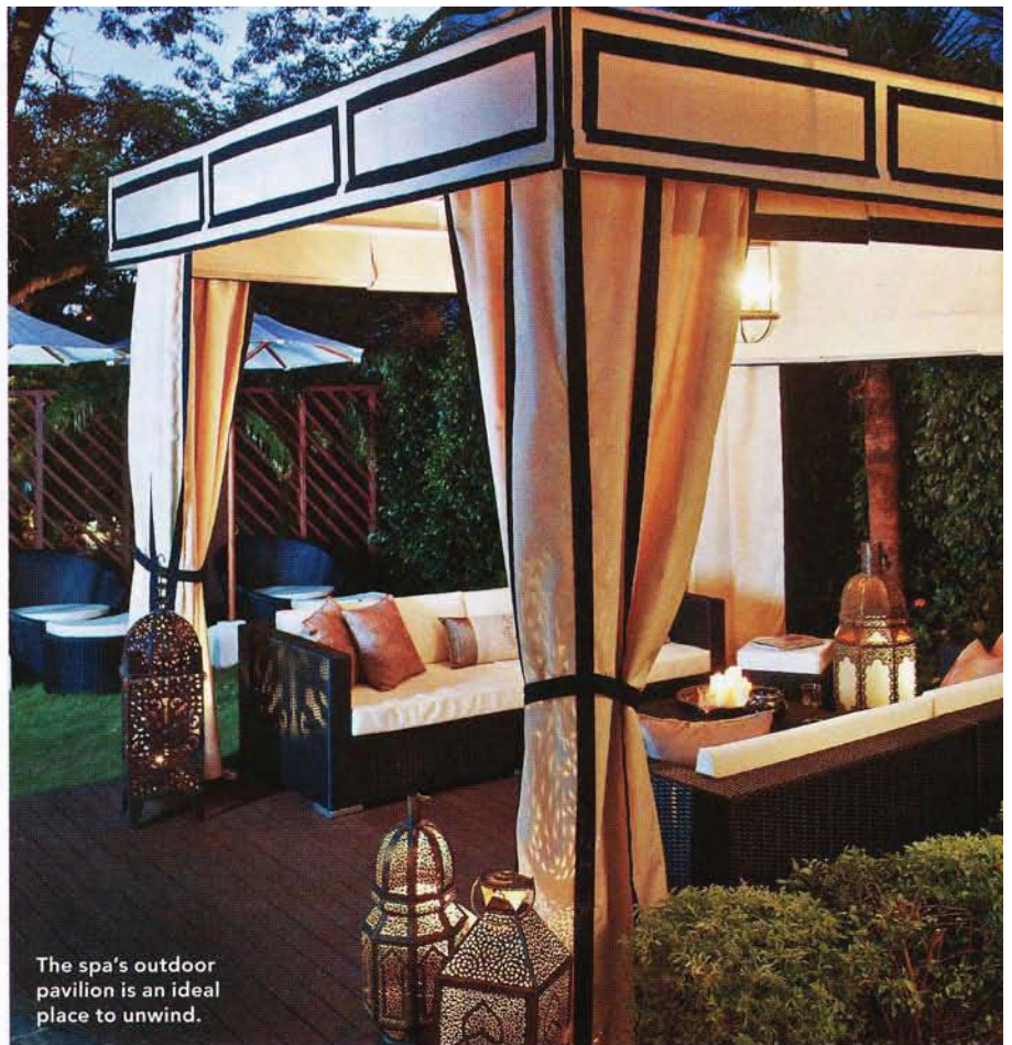
The spa's outdoor pavilion is an ideal place to unwind.

consultancy specializing in hospitality and wellness, took inspiration from the site's legendary location as a seaside getaway since colonial times. The 2,700-square-foot spa features six treatment suites, an outdoor pavilion, and an enclosed private garden. Capturing the exotic flavor of Hong Kong, the menu includes various signature rituals such as Opium ($166, 90 minutes), an addictive treatment that involves a poppy seed scrub and euphoric massage. The stage is certainly set for an idyllic return to the harbour city's illustrious past.—Heather Mikesell