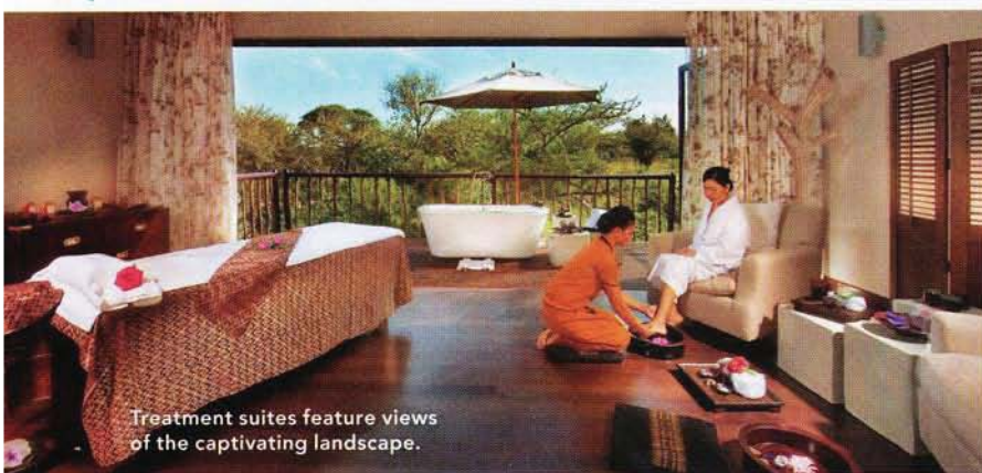
Treatment suites feature views of the captivating landscape.

Known for its exotic spa offerings, Anantara recently opened its third spa—this one in the heart of Serengeti National Park—in Tanzania. Anantara Spa at Bilila Lodge Kempinski is inspired by the African landscape that so captivated author Karen Blixen in Out of Africa . Designed with the landscape in mind, the spa features a laid-back elegance and includes four double treatment suites, one double Ayurvedic room, one double Thai massage room, and a relaxation lounge with reclining beds amid a beautiful garden. A visit to this luxe spa is like taking a trip back in time that will leave guests yearning for the bygone era that Blixen captured so eloquently.—H.M.