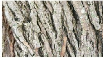
Arjuna Bark Extract

Reduces the volume of the jowls and sagging of the facial contours.