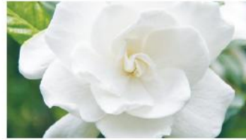
Gardenia Plant Stem Cells

Actively lifts jowls and combats skin sagging whilst improving the skin's overall resiliency.